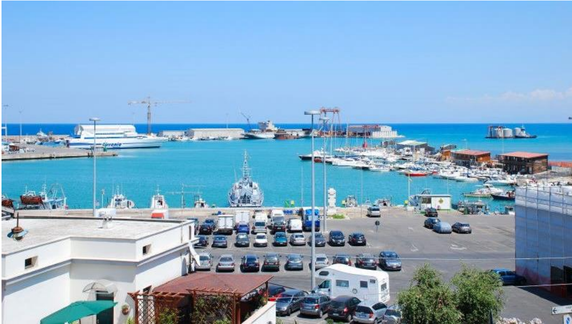
Figure 3 - Port of Termoli

2) "Marina di Santa Cristina", in locality Campomarino.