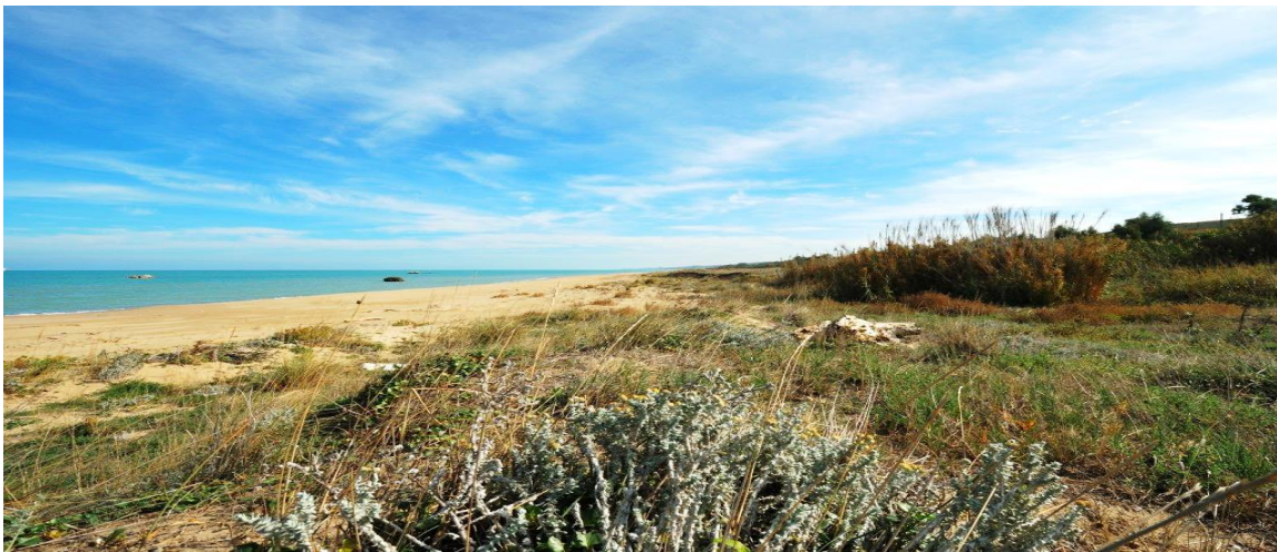
Figure 5 – View of Marina di Petacciato's beach

The beach of the small municipality of Petacciato (Fig.5), represents a significant stretch of untouched natural ecosystems of the Molise coast. The clear sand, together with the extensive dune area rich in vegetation and the thick pinewood, are the main features of this highly representative Mediterranean littoral area. In fact, the area include an important Site of Community Interest, called Foce Trigno - Marina di Petacciat, in turn involving the "Marine Reserve of Petacciato", with an overall extension of 747 hectares and a maximum altitude of 50 m.