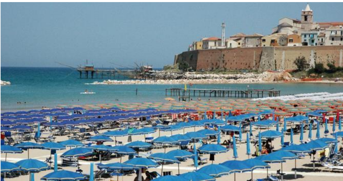
Figure 4 – Northern part of Termoli's beach