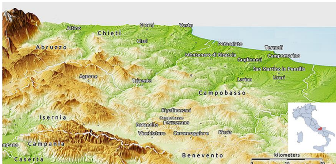
Figure 1 - Helicopter view of Molise Region

erosion problem closer to the works themselves, thus creating a domino effect. Moreover, the building of hard defence works during starting from the late '70s, has been already proved to have a heavy impact on landscape and on water quality.